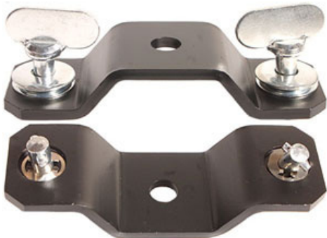
Omega Bracket (optional - not included)

IP65 Locking Power Cable Glare Shield (2) Lens Filters